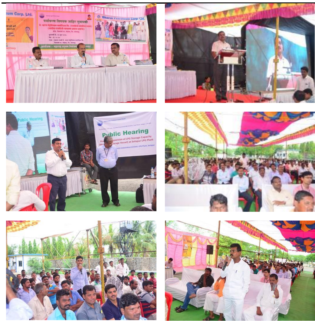
Figure 1.1 Photographs of Public Hearing

Suggestions, comments, views and objections of the public on environmental and socio-economic issues related to the project were invited through the notice. The key issues that came up for discussion in the Public Hearing and the targeted action plan have been summarized in Table 1.1 . Details of the records of Public Hearing minutes have been provided in Annexure of this report.